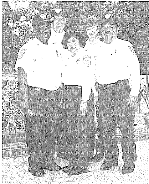
Partners in Protection

San Diego Police Department 1401 Broadway, MS 796 San Diego, CA 92101 (619) 531-2489