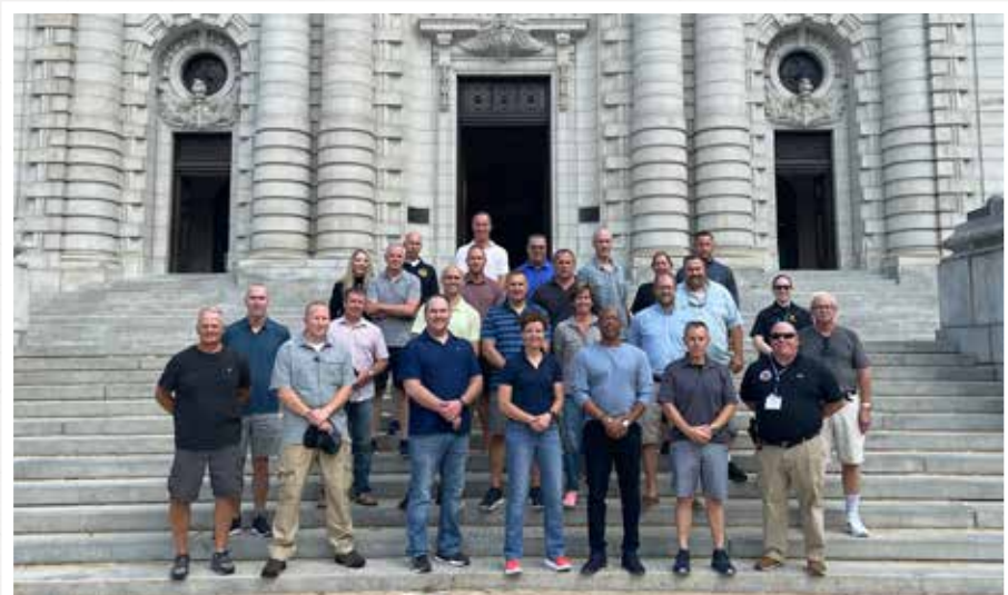
▲ 2022 North Atlantic Regional Meeting