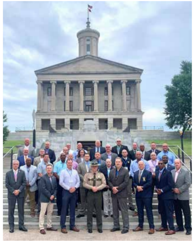
▲ 2022 Southern Regional Meeting