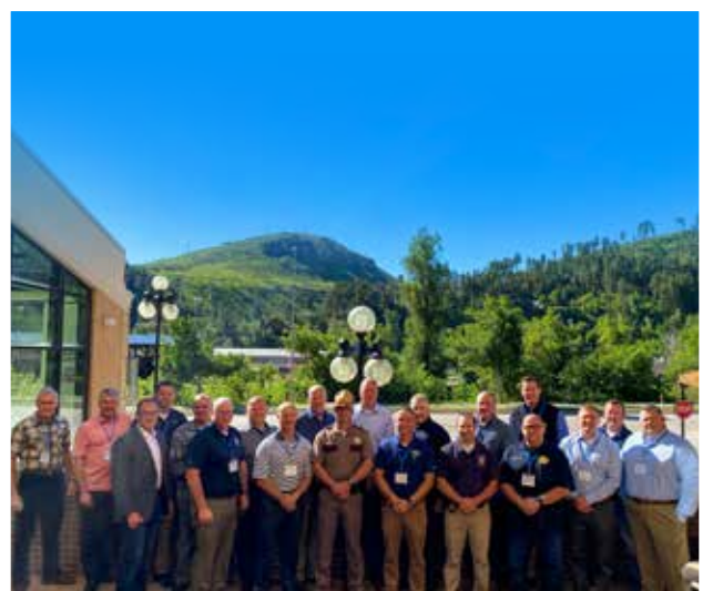
▲ 2022 Mountain Pacific Regional Meeting