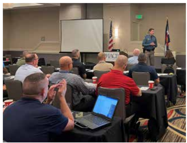
▲ 2022 SPPADS and SPPPOS Annual Conference Opening Session