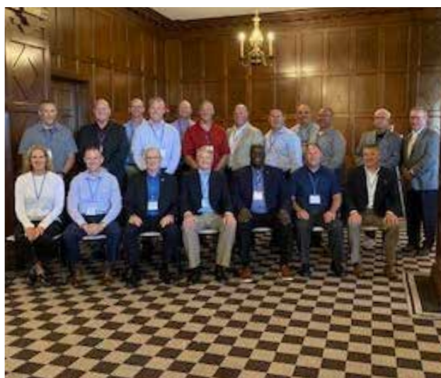
▲ 2022 North Central Regional Meeting